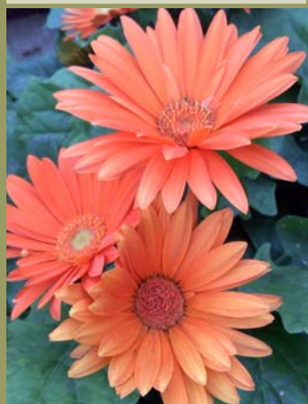
Just one more thing to thank God for!